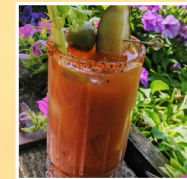
Bloody Mary "Absolutely" - 8 Absolut Vodka | Jimmy Luv's Premium Blend Mix | Spices